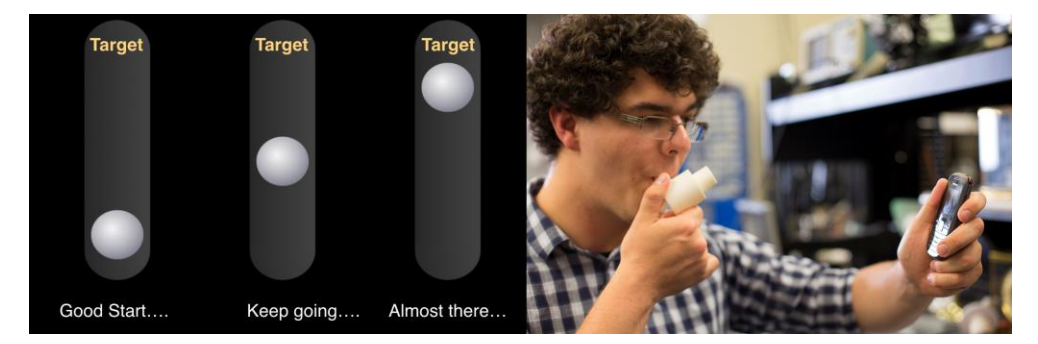
Figure 3. (left) As a person pushes more air out of their lungs, the ball in the SpiroSmart visualization rises to the top and encourages to the user to continue the maneuver. (right) The SpiroSmart vortex whistle can be used to control the diameter of the user's mouth, acting as a flow-to-pitch transducer.

those people, a 3D-printable vortex whistle was developed to hold a person's mouth open like the mouthpiece does for a spirometer (Figure 3, right). The vortex whistle has an extra useful property: the faster the flow of air that enters it, the higher the pitch that leaves it. In other words, the vortex whistle acts as a flow-to-pitch transducer that simplifies the sensing problem.